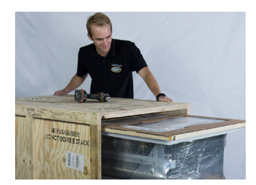
STEP 4 Slide the crate away from your range.