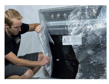
STEP 5: IMPORTANT! Remove all plastic to inspect for any freight damage to the range itself.